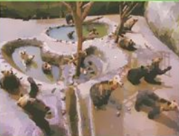
Second Farm (females only)

Farm area consists of two separate farms, with groups of male and female bears respectively. You can feed them with the "bear snacks" sold here, take a closer look from the "human cage" and see their cute babies at the "cubs farm."